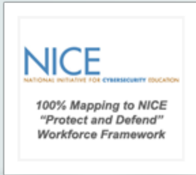
The National Initiative for Cybersecurity Education (NICE)